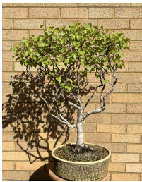
'Claire's' Silver Birch,